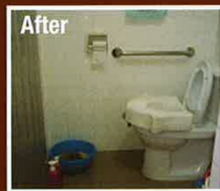
After Changed to a sitting toilet with an additional toilet raiser, installation of grab bar and anti-slip floor treatment

"My grandma had a history of repeated falls in the bathroom area. After the home modification, I feel more at ease when my grandma had to be alone at home as she can now move around more safely while using the bathroom."