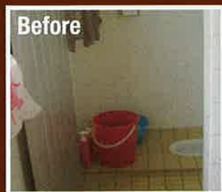
Before Squatting toilet with mosaic tiles

* Individuals who are under Public Assistance will be fully subsidised while those who require financial assistance will be means tested